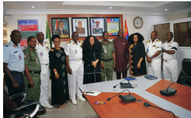
Arise Monaliza Foundation team courtesy call/partnership with the CDS