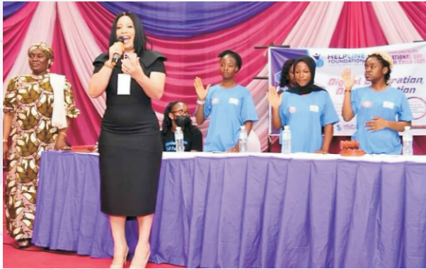
International Day of The Girl Child 2021