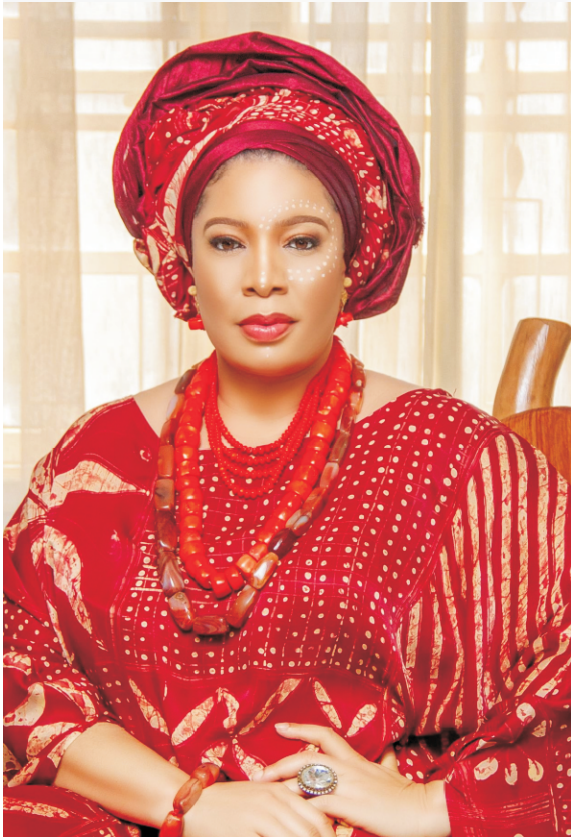
Founder, Arise Monalisa Foundation Convener